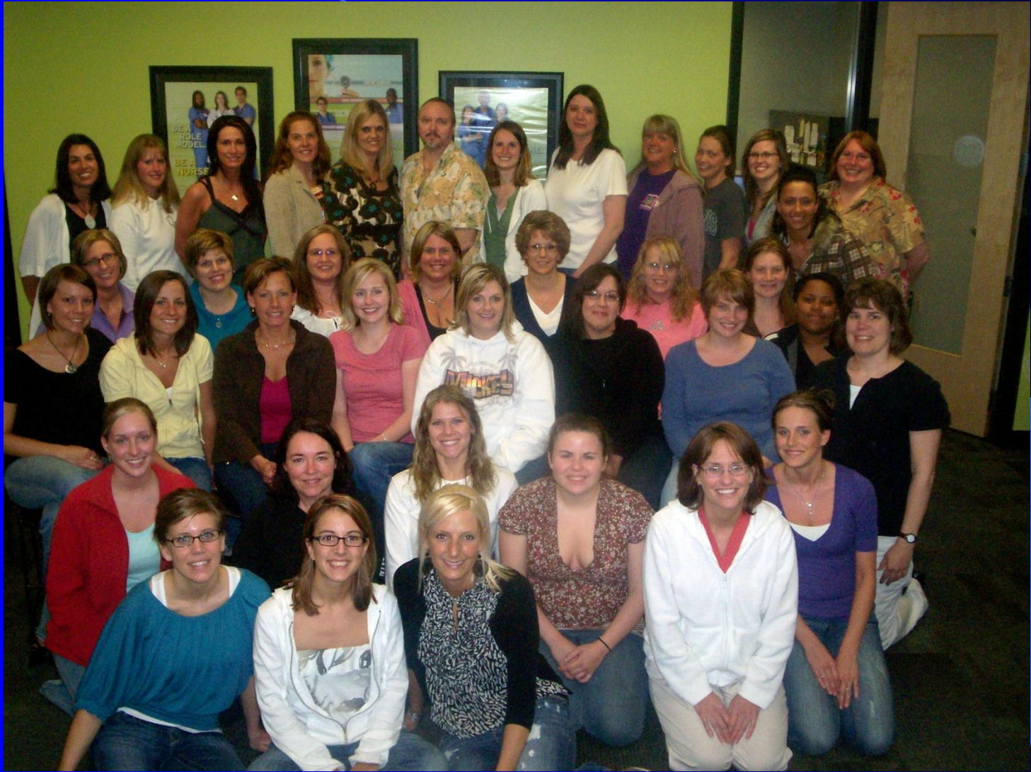
Winter 2009 RN Grads